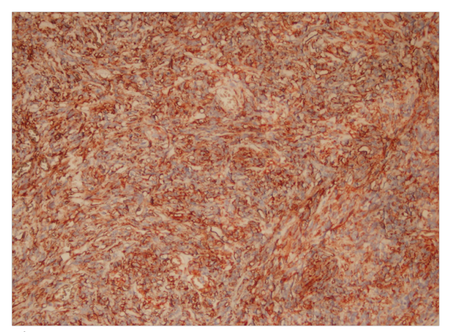
Figure 4. Immunohistochemistry shows positive CD 34.