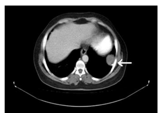
Figure 1. Axial computed tomography section shows a mass measuring 60 mm in diameter in the left lower lobe.